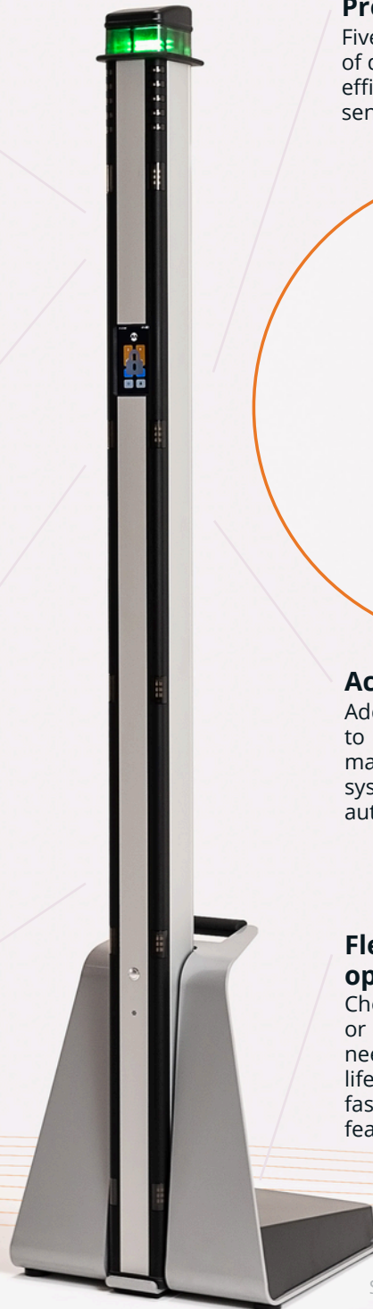
Shown in Silver

Choose from battery, 24V DC Charger, or Power over Ethernet (PoE) to suit your needs. Our Li-Ion battery offers extended life and superior performance, including fast charging and an automatic power-save feature.