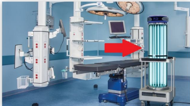
The Rapid UV-C Mobile System