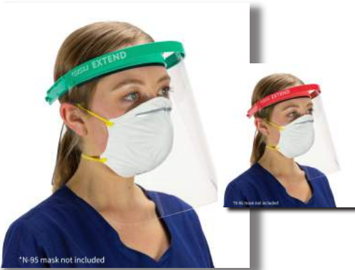
*N-95 mask not included